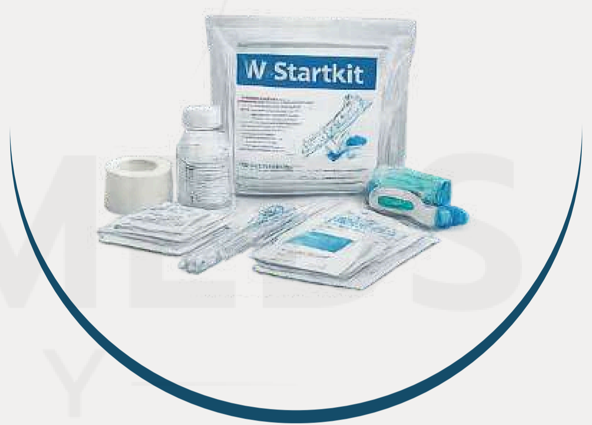
IV Start Kits