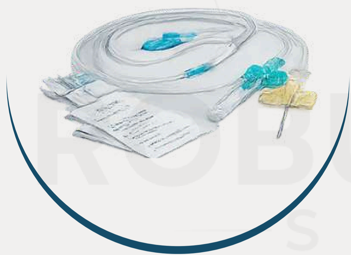
Blood Collection Sets