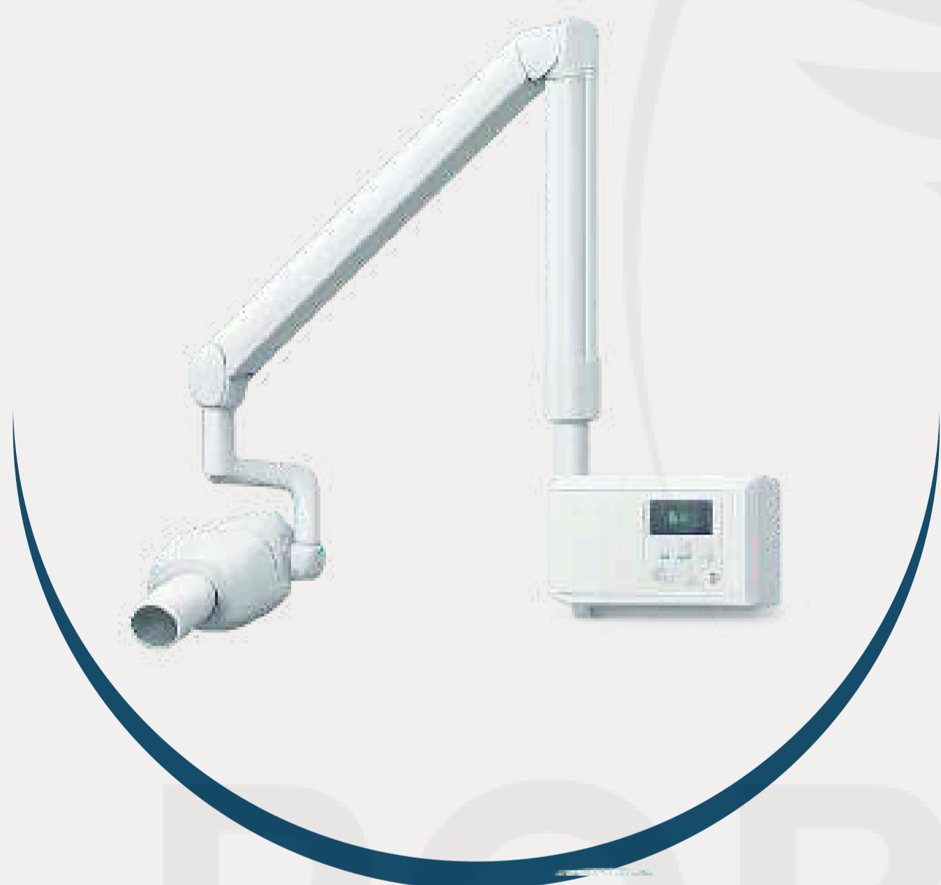
Dental X-Ray Machine