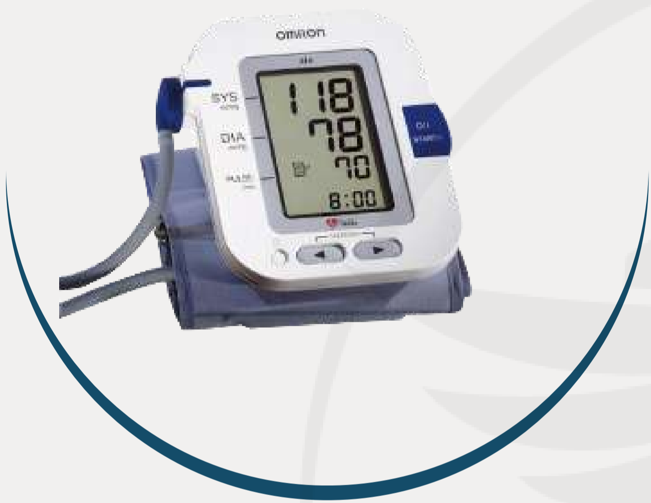
Blood Pressure Monitor