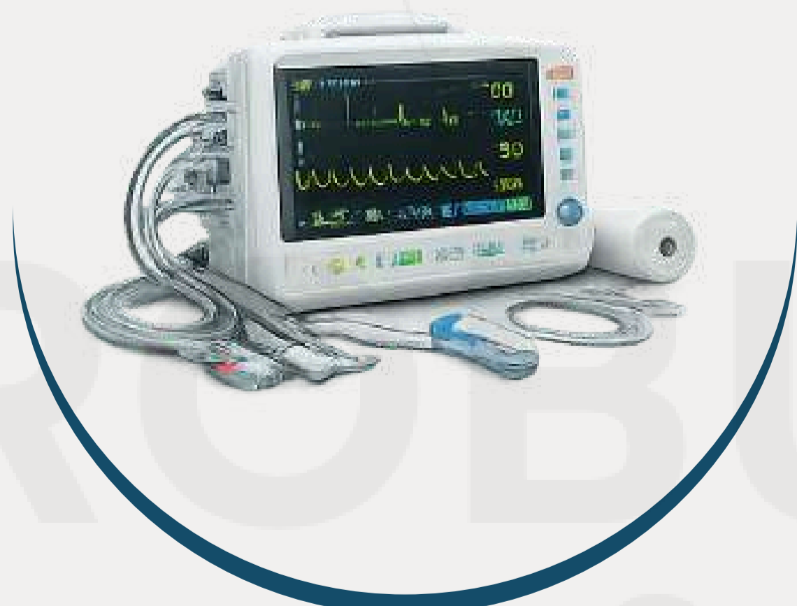
Vital Signs Monitor